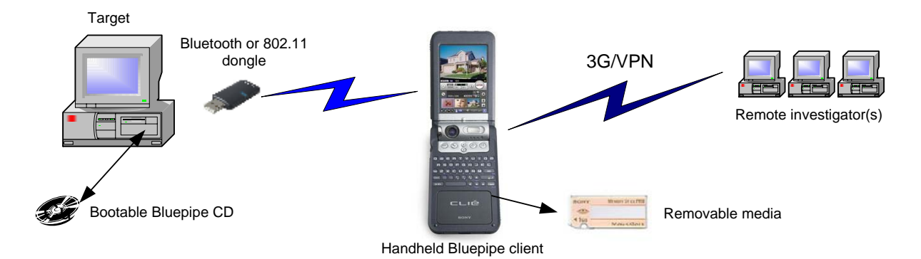
Figure 2. Current prototype implementation with a single client.